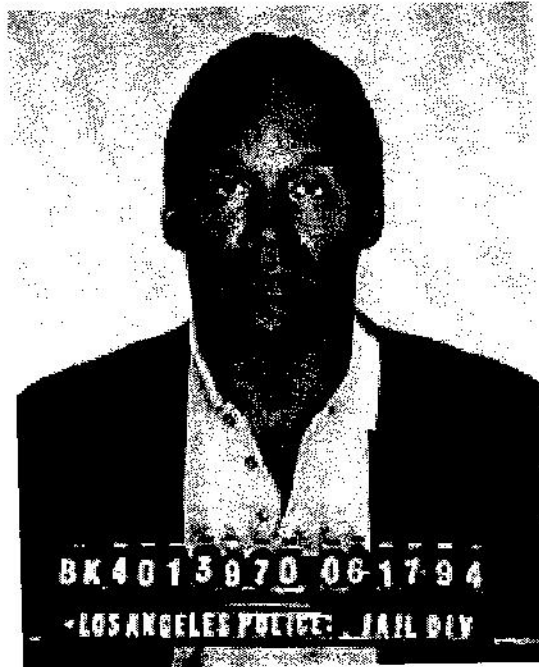
Mugshot of O.J. Simpson.

The extreme importance of the need for the accurate collection and analysis of physical trace evidence by police investigators and forensic experts was demonstrated in the O.J. Simpson double-murder trial. Many believe that the mistakes made by the police and forensic experts with regards to the physical trace evidence collected in this case led to the release of a violent murderer.